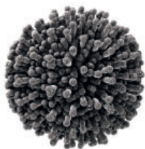
Chitosan from Aspergillus niger © Lallemant

The graph above illustrates, which is the result of a test carried out by the University of Salamanca. It shows the effect of LalVigne BOTRYLESS on inhibiting the growth of different Botrytis isolates in Petri dishes with MEA culture medium. This % of inhibition, for most of the isolates studied, was higher than 60% and in many cases exceeded 70%. The fungistatic effect is only one of the ways in which LalVigne BOTRYLESS acts in the vineyard to reduce Botrytis infection.